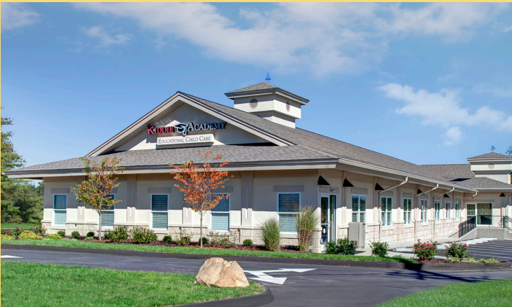
Kiddie Academy of Des Peres 13133 Manchester Road, St. Louis, Missouri