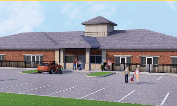
Kiddie Academy of Chesterfield 196 Hilltown Village Center, Chesterfield, Missouri