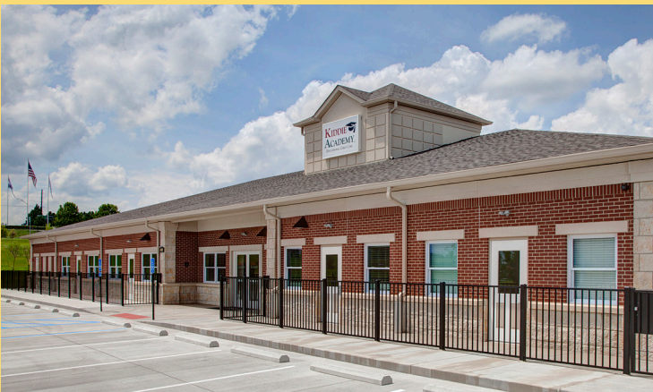
Kiddie Academy of O'Fallon 4088 Winghaven Boulevard, O'Fallon, Missouri